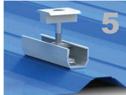
Install the mid clamps with mini rail.