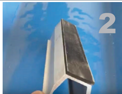
Each mini rail have been preassembled with one EPDM rubber pad.