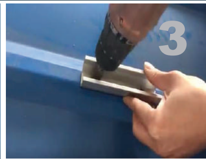
Fasten the mini rail with metal sheet roof with 2pcs st6.3*25 tapping screw.