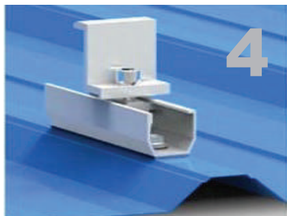
Install the end clamps with mini rail.