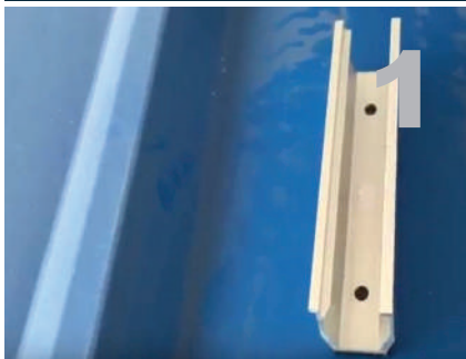
Mark the locations of mini rail.